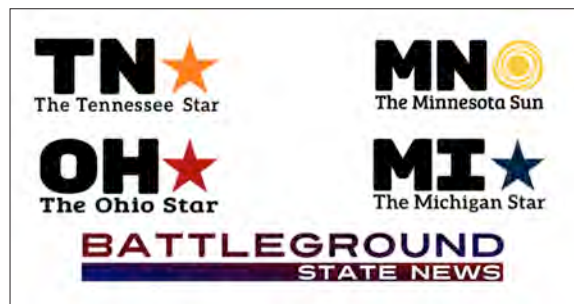
Four websites that look like reputable local news are actually part of a network of sites set up by Republican consultants. Archived September 6 2019. 25