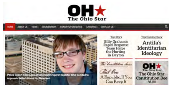
A site that poses as a local Ohio newspaper was actually set up by Republican consultants. Retrieved October 16 2019. 24

There are five of these sites as part of the Star News Digital Media network, sites which are partly funded by the Republican candidates that these news sites are covering.