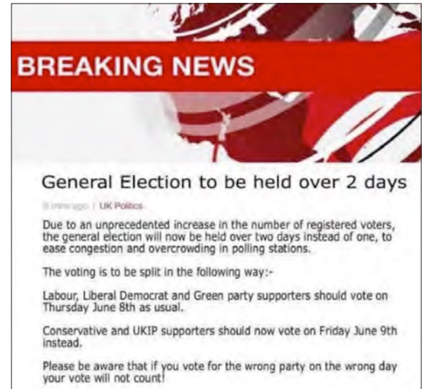
An imposter news site used the BBC logo to peddle misleading information about the UK election. Archived on September 6 2019. 17

Since then, we continue to see examples of agents of disinformation using the logos of established news brands to peddle false and misleading content. Here are two examples of the BBC being used in this way. One circulated in the lead up to the 2017 UK general election and was posted on social media. The image says that the election is over two days, and depending on your party affiliation, you need to vote on the right day.