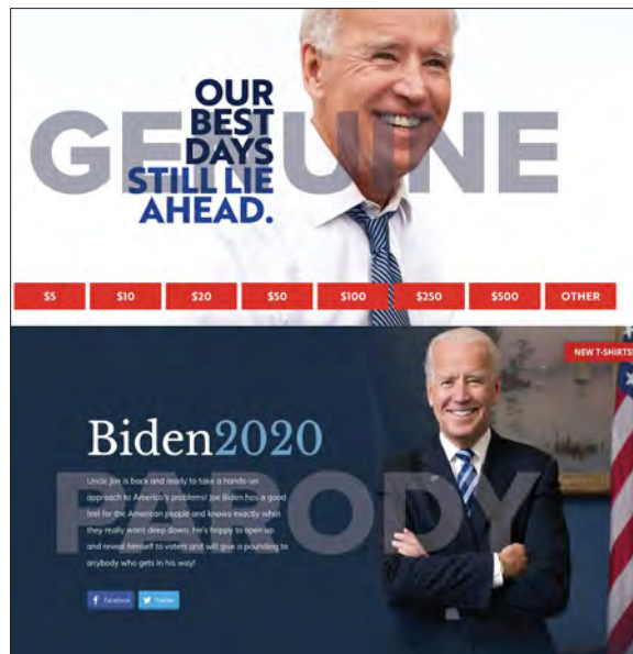
The genuine and parody Joe Biden websites are almost indistinguishable at first glance. Retrieved 14 August 2019.

More recently Snopes fact-checked a Babylon Bee story