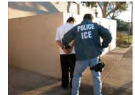
These two images were overlaid to make it appear that ICE officers were present at a voting location. Archived on October 16 2019. 26

Immigration Police arresting people at Voting Booths! ¡Policía de inmigración en las cabinas de votación! pic.twitter.com/Fzbz5oAiNM